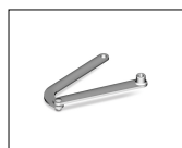
LT302 Arms short for articulated motor.