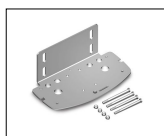
KT208 Plate for fixing to post R23 series.